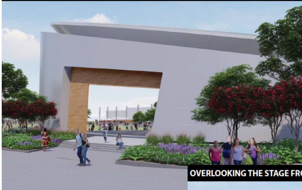
PARK ACCESS FROM DOWNTOWN