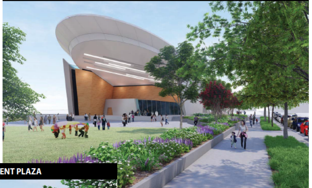
A CIVIC PARK AT THE EDGE OF DOWNTOWN